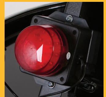
Dust Sentry™ bin level sensor flashes red, alerting you when drum is full.