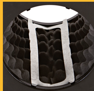
Stacking sound filter reduces already quiet system by additional 6-7 dBA.